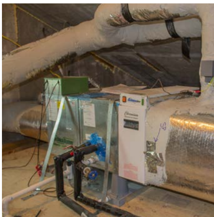
The air-to-water heat pump is installed within the conditioned space of the insulated attic.

subpanel of critical backup circuits while lithium ion batteries provide 200 Amps of standby power “off the grid” during emergencies.